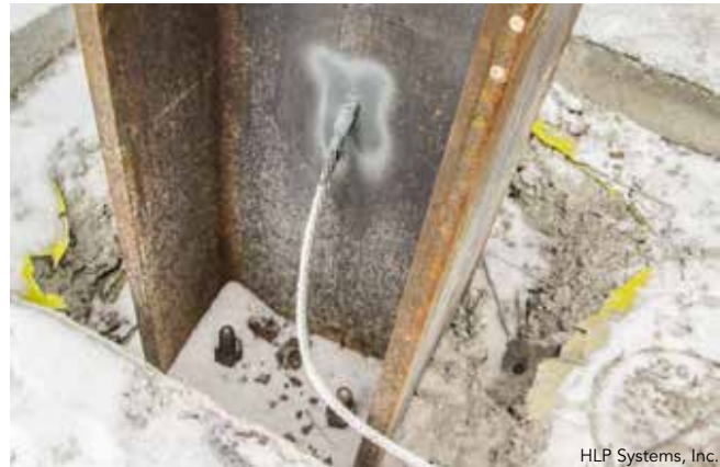
▲ At column bottom, an exothermic weld connects a cable leading to ground electrodes.

ing steel columns provided electrical continuity between new rooftop air terminals and ground electrodes—without damaging interior finishes.