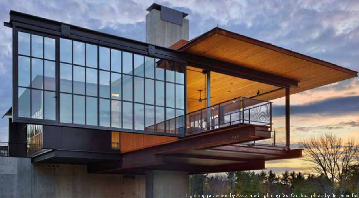
Lightning protection by Associated Lightning Rod Co., Inc.