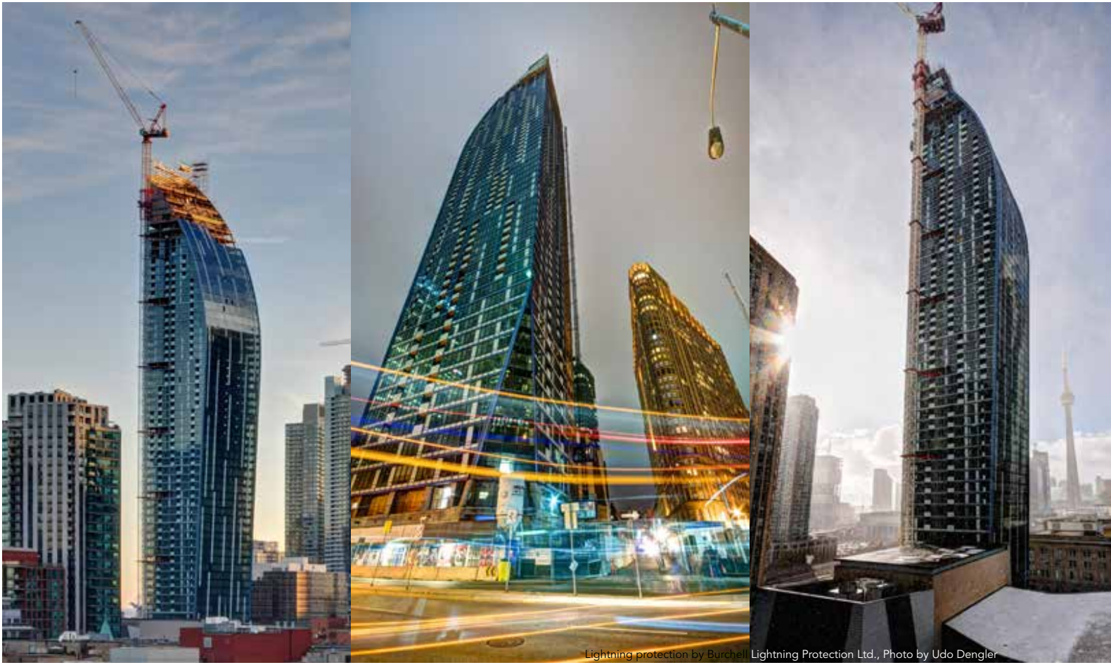
Lightning protection by Burchell Lightning Protection Ltd., Photo by Udo Dengler

◀ Air terminals are required on the wood-framed roof of this residence by Olson Kundig Architects in the Berkshires. But the steel chimney cap and cantilevered beam do not require air terminals; they are connected to the grounding system and act as strike termination devices. The beam supports a trolley-mounted glass wall that can be rolled into place to seal the house against weather.