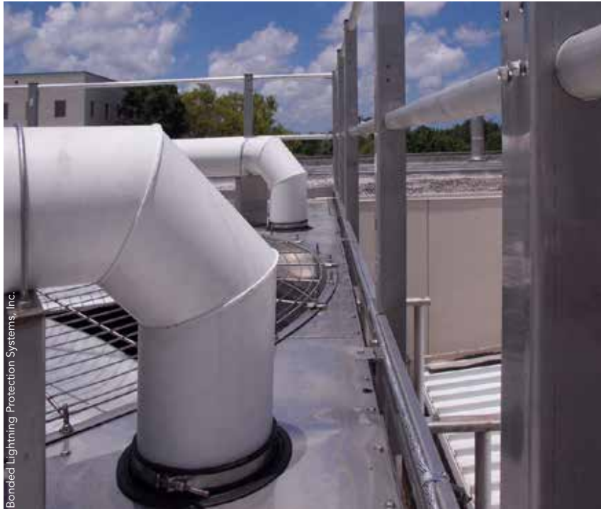
Bonded Lightning Protection Systems, Inc.