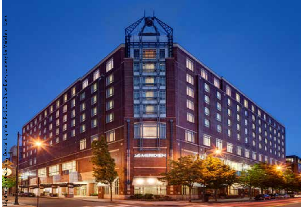
▲ The steel turret atop Le Méridien-MIT Hotel in Cambridge, Mass., acts as a strike-termination device and is connected via the LPS to ground. A conventional air terminal is visible on the parapet in the lower-left corner of the left photo.

tion can be downloaded at www.constructionspecifier.com/lightning-specs .