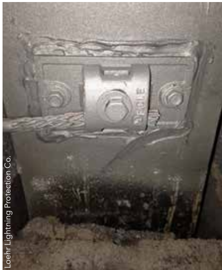
Loehr Lightning Protection Co.