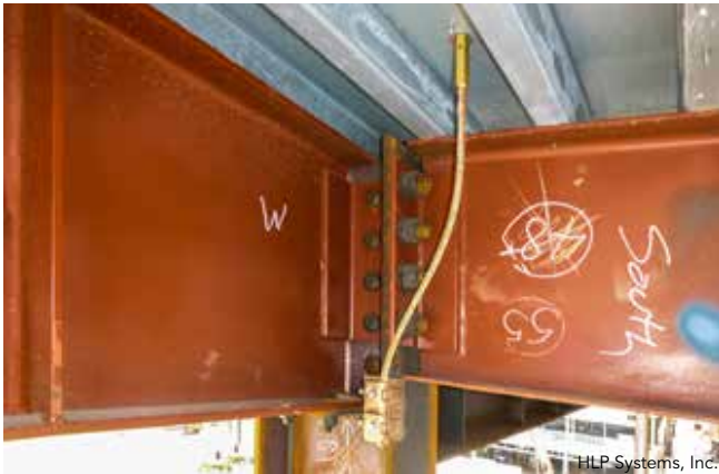
▲ From air terminals above the roof, lightning travels via a roof-penetration device to a cable and bolted connection into the steel framing.