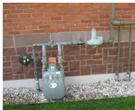
Figure 4. Ground Connection to Gas Service Entrance. The gas service and all exterior metal pipes are connected via the ring ground.