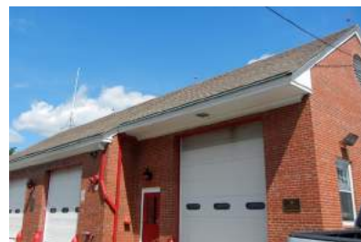
Figure 8. View of the Wethersfield, Connecticut Fire Station No. 2, one of the oldest in the state. The tower behind the station at far left serves the station's communication needs. Air terminals are spaced at 20-ft increments along the roof ridge line.

"Again, what we did here was install direct-strike lightning rods or air terminals on the roof in the places where lightning might strike based on a 150-ft strike radius. (Figure 8) As at Simsbury, the rods are within 24 inches of the outer edge of the roof and 10 inches taller than the objects they're protecting. Here the lightning rods are tied together by lightning cable containing 29 strands of 17-gage copper wire. The cables have multiple paths to ground situated not more than at 100-ft of perimeter apart on average.