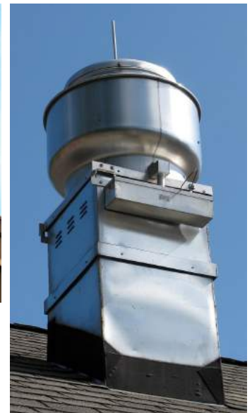
Figure 2. Rooftop ventilator with air-terminal. The otherwise ungrounded ventilator is within a six-foot strike distance of the lightning protection system's cabling (not shown) and is therefore connected to it.