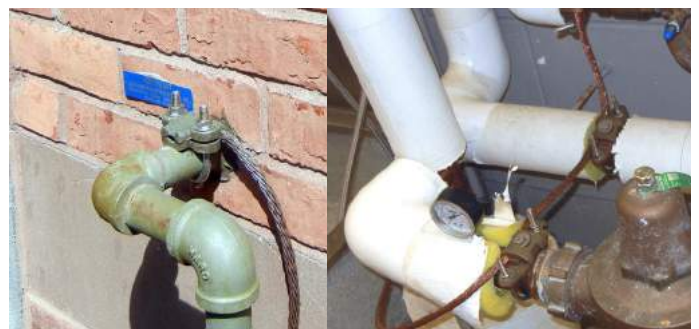
Figure 3. Braided lightning conductor (29 strands of bare 17-gauge copper) is shown bonded to the fire station's water supply line, left. Note the use of UL96-approved copper alloy mechanical clamps. The clamps resist loosening and corrosion. Similar connections were applied inside the building.