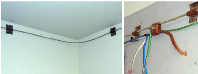
Figure 6. Halo ground installed around interior walls (left) to facilitate connections to electrical, telephone and electronic equipment, cabinet racks and wall penetrations, (right). Note the generous size of the braided lightning cable entering from lower left.

The chief added, "To facilitate bonding inside rooms we installed halo grounds, or lengths of copper lightning conductor encircling the rooms at near ceiling level. We installed two halos in the fire station: One is in the communications room and one in the server room where everything is terminated." (Figure 6)