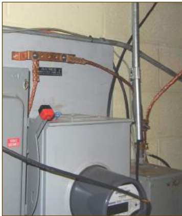
Figure 10. Upper photo: grounding conductors run along walls and from room to room in the venerable fire station. Lower photo: a copper ground bar serves as the ground-to-lightning system bus at the station's service entrance. Note that braided copper lightning cable extends all the way to the service entrance.

Was all that grounding — and particularly all that copper — expensive? Not according to Jim Barnard. "Proper lightning protection isn't a huge expense; it's generally less than 1% of the cost of the property you're protecting. However, the cost of not putting lightning protection is insurmountable."