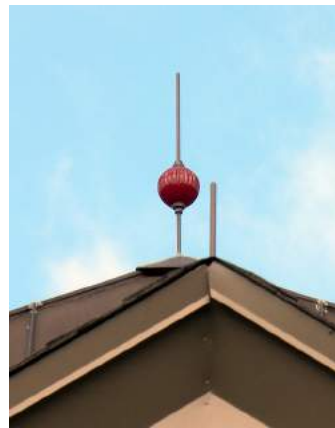
Figure 1. Air terminals (strike termination devices) are mounted at a code-mandated maximum 20-ft interval on the roof of the Simsbury Main Station No. 1. The decorative terminal is one of several installed for architectural reasons. Note the braided copper lightning conductors mounted along gable edges.

terminals to each other and to the earth at not less than every 100 ft of the building's perimeter. Any metallic item we come near to we bond if it falls within a six-ft side flash distance (Figure 2). We also have to bond any underground water or gas pipes where the lightning might follow that path. (Figures 3 and 4, respectively). All these systems must be bonded together.